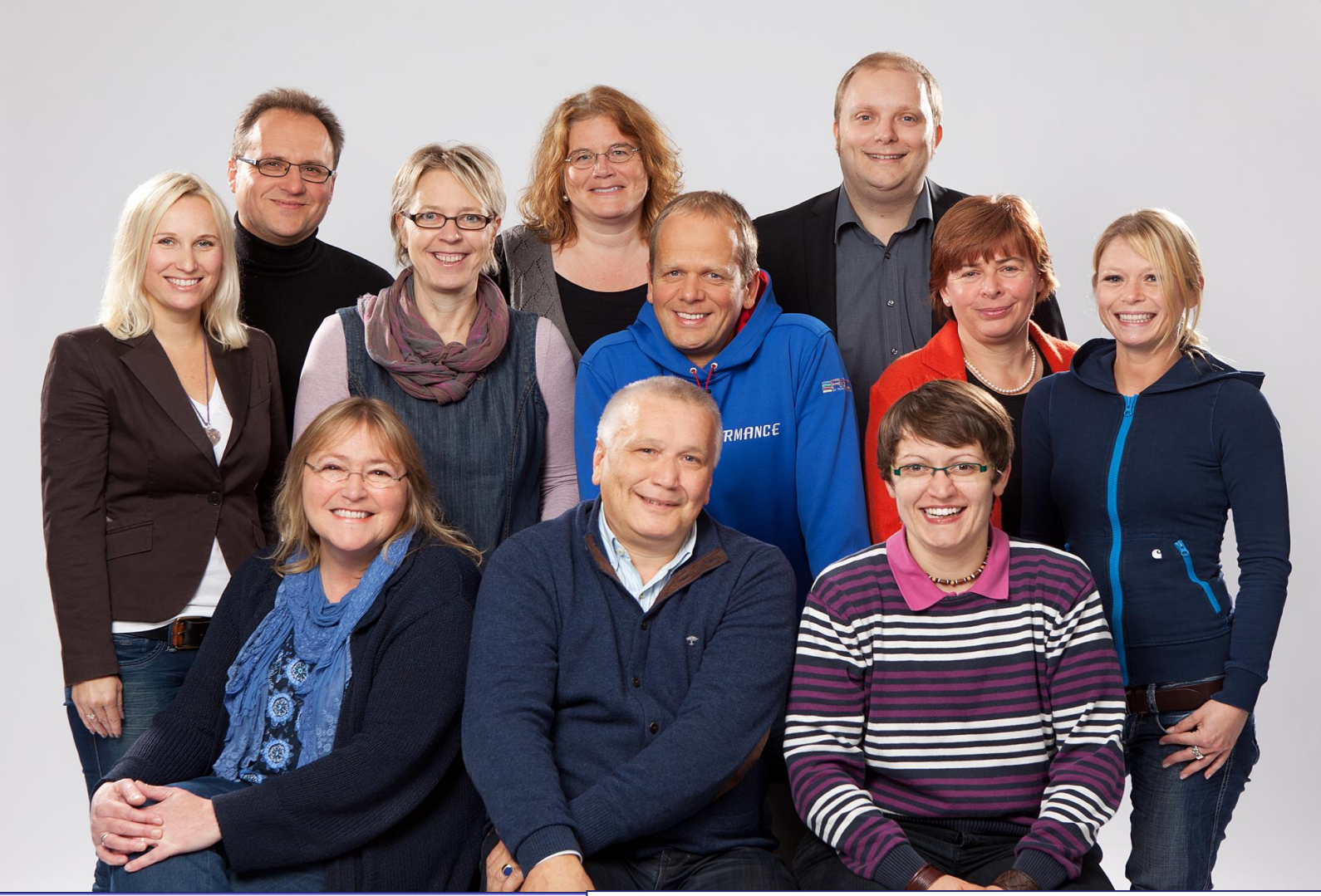
MAMBA project partners